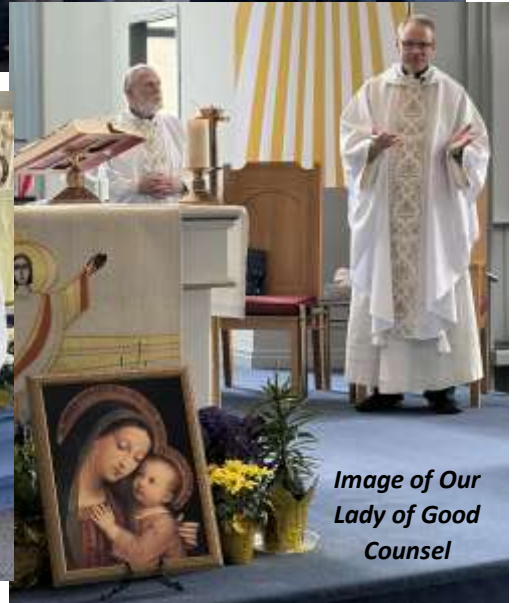
Image of Our Lady of Good Counsel