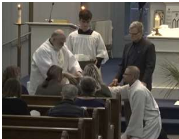
Holy Thursday - Mass of the Lord's Supper and washing of the feet.