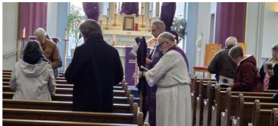
Fridays in Lent -Weekly Stations of the Cross