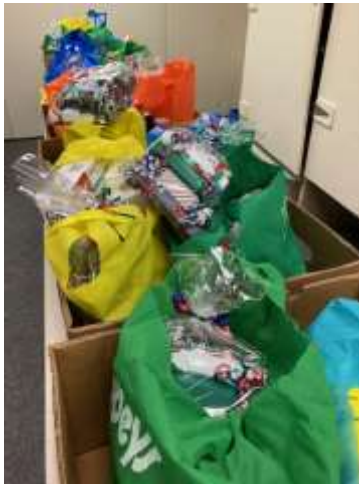
St Vincent de Paul Christmas Baskets

This year 56 families and 16 individuals received Christmas hampers. This amounted to 140 adults as well as 70 children being served. The hampers contained food staples as well as Christmas goodies. Our clients chose from an assortment of mitts, hats and scarves collected by St. Ann school.