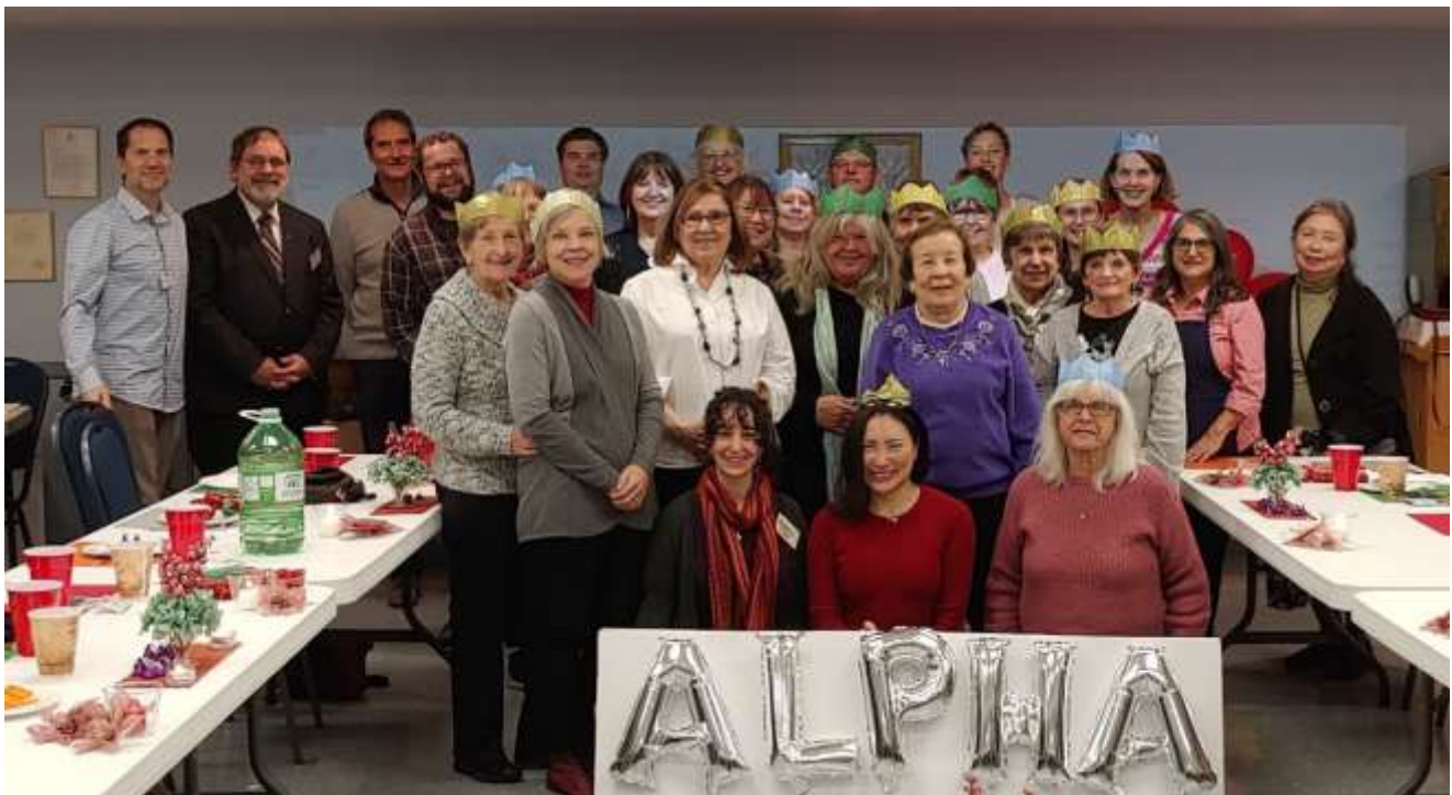
Final Session: Alpha Retreat, Sunday, December 3, 2023

May the lessons learned and connections made during this Alpha program continue to blossom in our individual journeys of faith. Let us carry the spirit of unity and love forward, embracing the transformative power of God's grace.